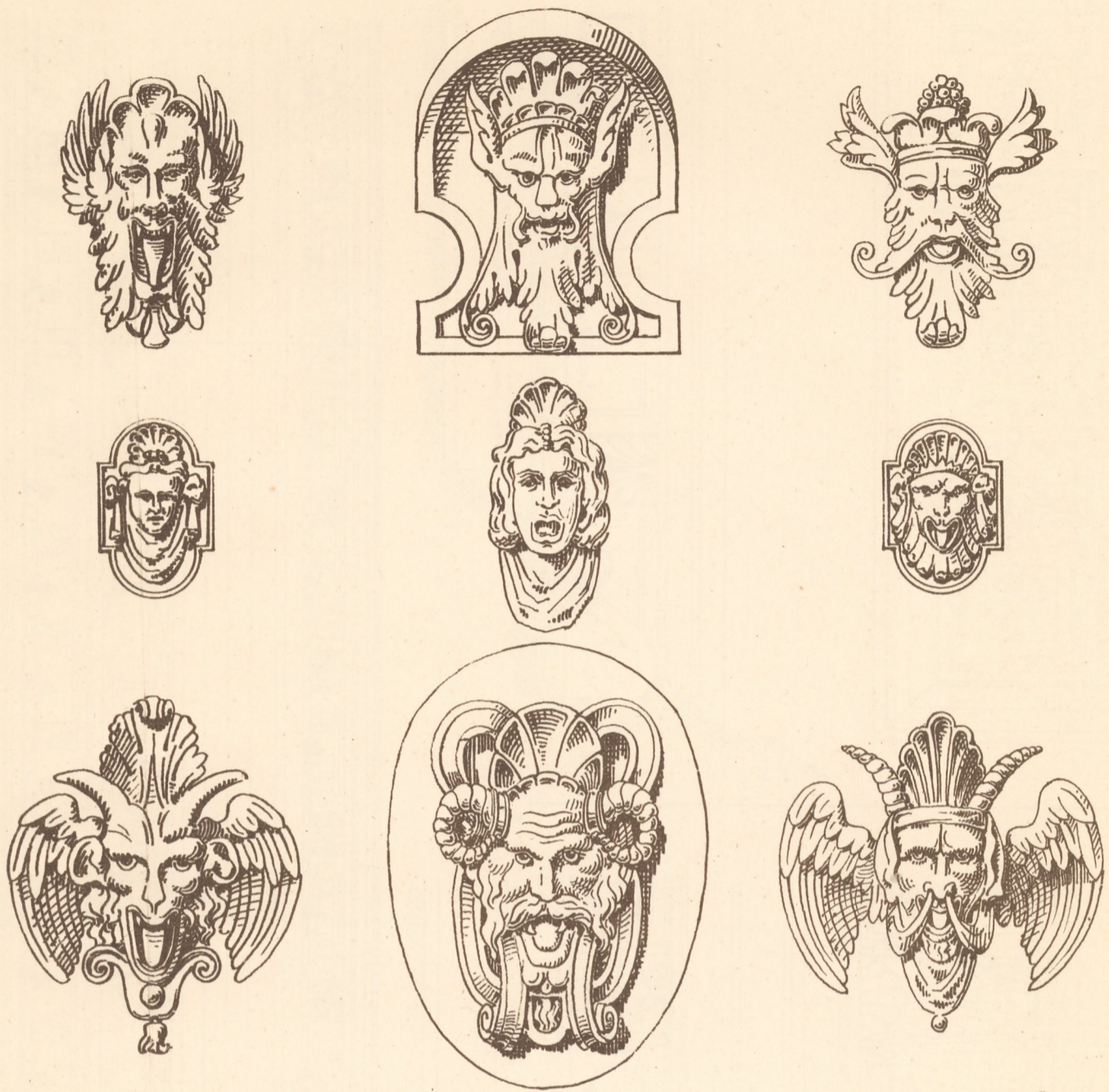
\frac{1}{10} d. Natur.