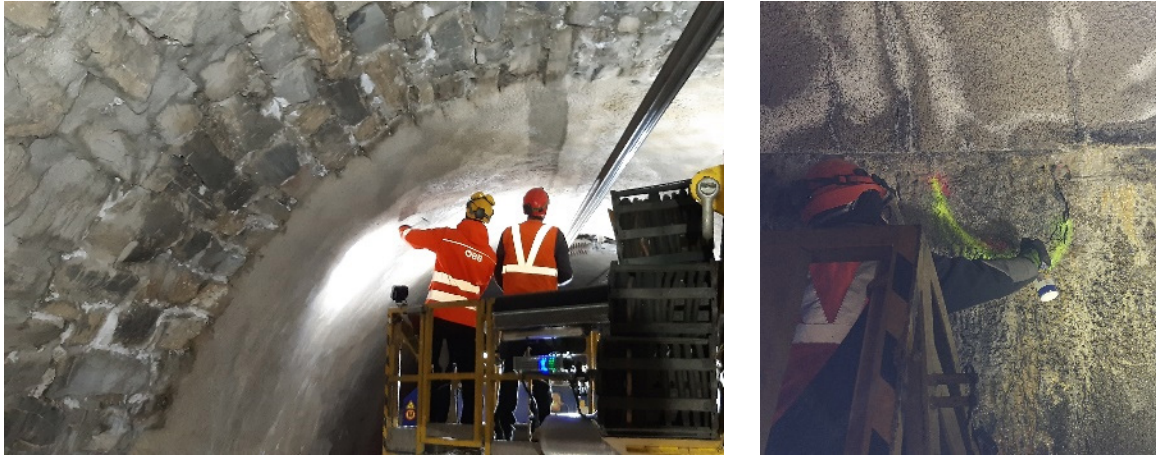
Figure 5: Inspection and documentation of the lining of a tunnel

The images in Figure 5 show some circumstances that must be dealt with when inspecting tunnels for railway operation - and similarly for road operation. On the one hand, as shown in the left-hand image, climbing aids and transport equipment are required in order to be able to inspect the entire lining of the tunnel visually. In the case of railway tunnels, this is significantly influenced by the requirements for rail-bound solutions and the presence of overhead lines. On the other hand, a more comprehensive survey of the damaged areas, as shown in the picture on the left, must also be carried out as a rule in order to record and assess their effects on the load-bearing capacity and traffic suitability of the tunnel.