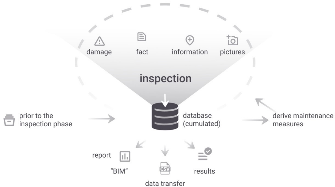
Figure 4: Schematic workflow for an inspection and documentation of inspection works and damages with emphasis on the use of a digital inspection methodology (adapted from [6])

The contents described in chapters 4.1 to 4.4 are part of a comprehensive process that is used both for non-digitalized inspection and for the application of a digital solution - albeit in partially different approaches. This is summarized in Figure 4 - with a focus on the digital implementation of the process.