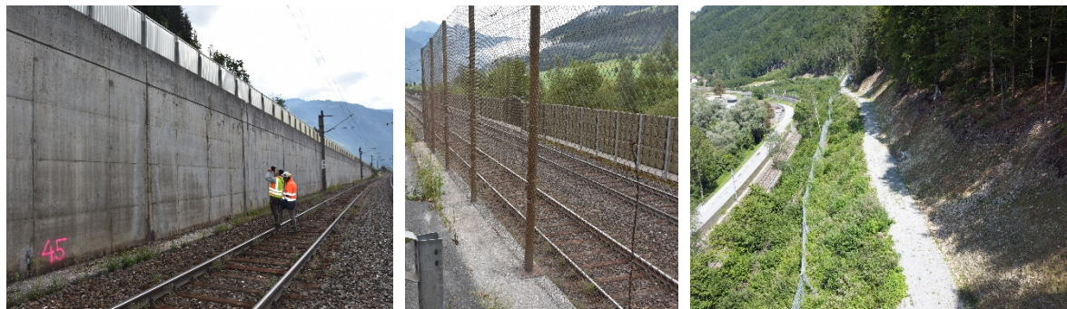
Figure 7: Example of assets along the Austria railway lines, retaining structures (left), noise-protection constructions (centre), natural hazard-protection structures (right)

In addition to the tunnels mentioned in this article, the Austrian Federal Railways network also includes a large number of other structures to which the workflow described in this article can be applied. The aim here is to reduce the workload of the inspection personnel and, above all, to reduce track-barrier durations while maintaining a sufficient safety level.