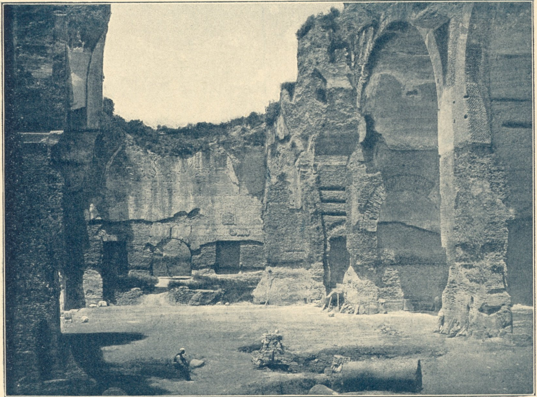
Fig. 79. Hauptsaal der Thermen des Caracalla in Rom.