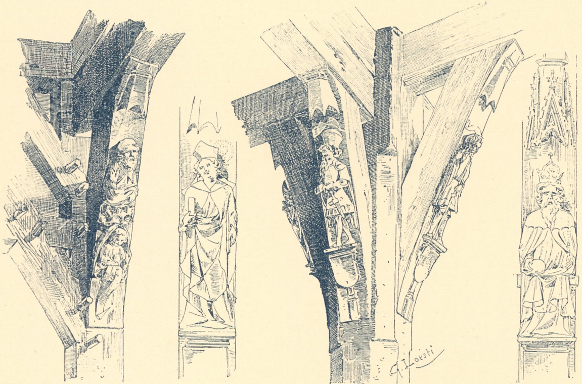
Fig. 327. Altes Rathaus zu Esslingen.