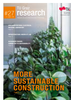
#27: SUSTAINABLE CONSTRUCTION