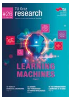
#26: LEARNING MACHINES