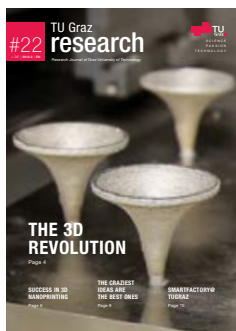
#22: ADDITIVE MANUFACTURING