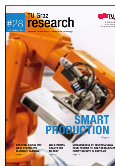
#28: SMART PRODUCTION