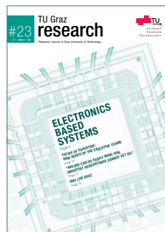
#23: ELECTRONICS BASED SYSTEMS