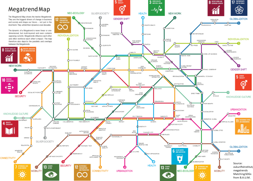
Figure 5. matching SDGs with megatrends.

discussion why a goal has been rated material and what it means in the strategic context (what does this SDG mean for us and what does it not mean?) is more important than summing up implemented and planned projects shown in fig.3. To underline the strategic dimension of the CheckS, B.A.U.M. has matched the SDGs with the megatrend-map (zukunftsinstitut, 2021) in order to develop a future oriented company strategy which perfectly integrates sustainability and the “deep currents of change” represented by the megatrends.