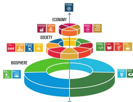
Figure 1. Rockström et al 2015.

We will later describe in the evaluation of 43 CheckS enterprises from different branches and sizes whether in their results Rockström's theory is reflected.