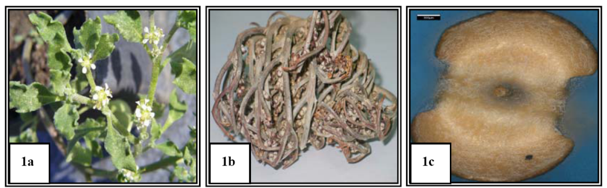
Figure 1.a Stereo-photomicrograph of the fresh Anastatica Hierochuntica with white flowers. b. The dried Anastatica Hierochuntica : indurated curled up, dormant and brown in color. c. IFM true colour surface profiler of the flower and stigma.

3. Yoshikawa M, Xu F, Morikawa T, Ninomiya K, Matsuda H Anastatins A and B, new skeletal flavonoids with hepatoprotective activities from the desert plant Anastatica Hierochuntica. Bioorg Med Chem Lett. 2003 Mar 24; 13(6): 1045-9