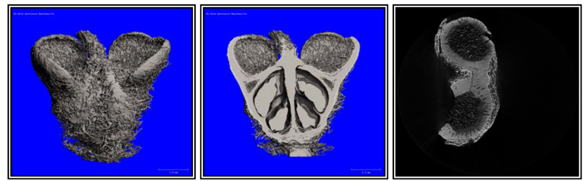
Figure 3. The cross sectional image of the central core and cortical thickness of Anastatica Hierochuntica L , flower with a raised stigma. Scanco \mu CT-35 Scan. Energy 45 kVp, image matrix 2048 x 2048 x 925 pixel

Figure 2.a. The central core of Anastatica Hierochuntica L petals revealed a raised stigma. b. Numerous stellates raised as singular inoculums or out-budding from the flower petal epidermal surface. Each end point is sharp horn-like prominences. c. The elongated sigma with its putative pollen.