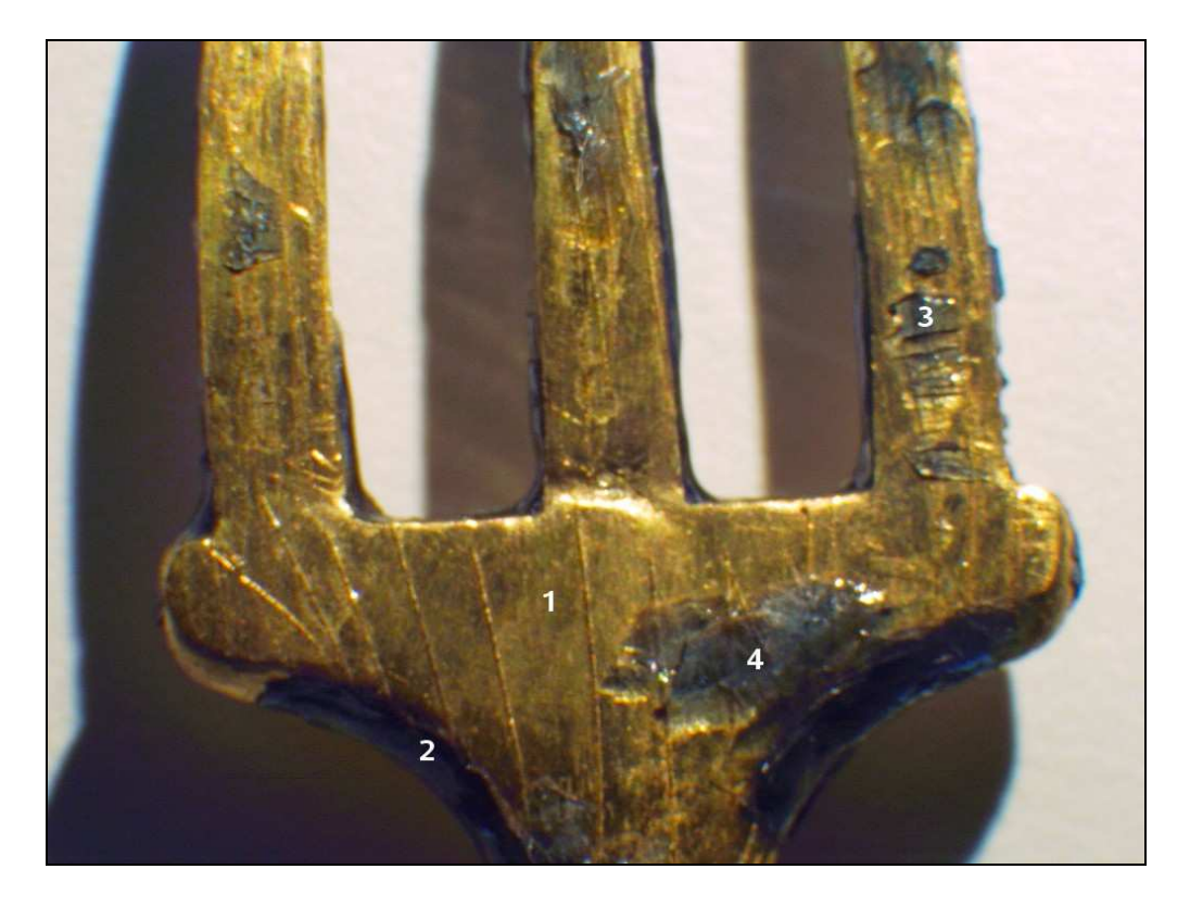
Figure 2. Trident of the Poseidon figure from the Saliera. The numbers indicate the positions for analysis (1 – gold body, 2-4 – enamel).