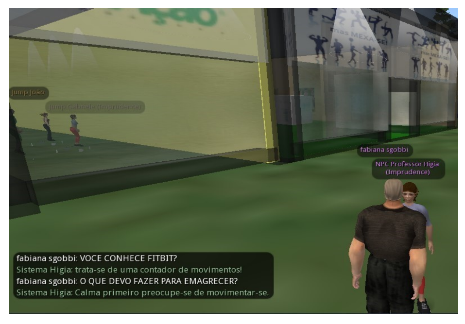
Fig. 5. Interaction of the practitioner with the HIGIA System

The conversation between the user's avatar and the agent involves answers emerged from the knowledge database built using the AIML language. The patterns of derived answers and questions were prepared in line with Ryan and Deci's [18] Theory of Self-Determination and with the support of physical education experts and a doctor. All manifestations of the conversational agent/NPC were designed in order to motivate the user to become physically active. Suggestions, tips, recommendations for health improvement in regard of obesity are presented in the dialogues established between the user and the agent (chatterbot). The table below shows a few examples of messages presented to the users.