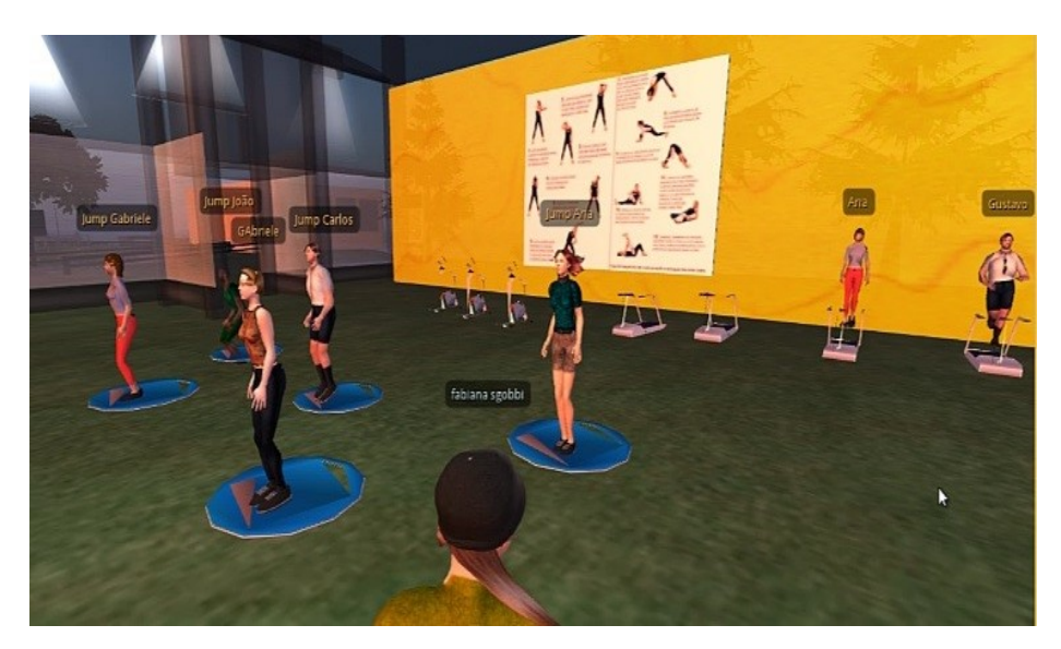
Fig. 3. - Aerobics class

When starting the participation, each person received a motion sensor which should be used 24 hours a day and should be synchronized at least once a day, through a mobile application. They also had their weights and abdominal circumference recorded. They also visited the virtual world, followed by the researcher who provided guidance concerning the navigation and the use of features available in the HIGIA System.