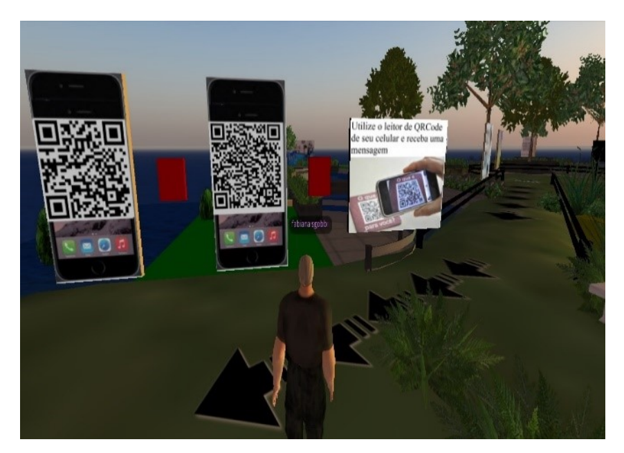
Fig. 4. – Season facts and photos

During the first stage of intervention (which lasted one month), the users could visit the virtual world as many times as they wanted. Thus, they could experience a fitness virtual environment. One of the participants mentioned that "it was the first time that he had ever stepped in a gym". They could also watch videos about methods and ways of losing weight, received tips from HIGIA's System conversational agent and, during the day, they also received SMS messages. Such messages were generated upon the analysis of the sensor's data, aiming at reinforcing behaviors or advising.