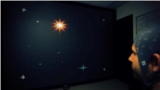
Figure 1. A rich visual experience that includes controlling the behavior of stars with BCI.

A typical session has three parts: first the system computes a classifier, then we validate and improve the classifier with a cue-based classification task, and the third part is a free choice task. In a series of pilot studies we have explored various types of stimuli, varying mostly in shape, frequency, size, and motion, and have eventually settled on an immersive experience that includes a visualization of deep space. In the background there are small stars, intended to create the illusion that the user is moving in space (this experience is typically presented in stereoscopic display). Occasionally larger stars appear, and the user is expected to control these stars by "thought". There are four types of stars, each with different frequency; typically we use 17.1, 24, 30, and 40 Hz, using the 120 Hz projector. When an SSVEP response to a specific star has been detected, the star starts moving towards the user; otherwise it gradually fades out.