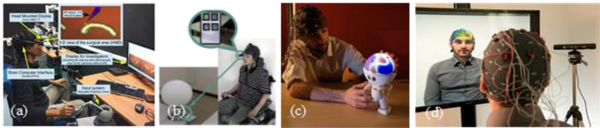
Figure 2: examples of applications combining AR and BCIs (a) Surgeon laser microsurgery training [6]; (b) Home automation system to control a lamp using P300 [36]; (c) TEEGI, brain activity visualization puppet [18] (d) MindMirror: brain activity visualization [30].

environment to allow disabled people to safely learn how to drive a wheelchair. Among different modalities to drive the wheelchair, they designed an SSVEP-based solution to control the direction. The goal of AR in this system was to be able to provide different driving scenarios by integrating virtual obstacles to the real world scene while still ensuring users' safety.