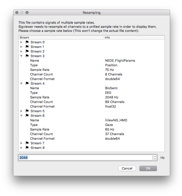
Figure 2: Resampling dialog window for XDF files.

There are two ways to save events for XDF files; events are either stored in a new XDF file or appended to an existing XDF file. Another recent change regarding events is that SigViewer now exports event to plain-text CSV (comma separated values) files for all supported file formats. Previously, it was only possible to export to binary EVT files (which are essentially GDF files without signals). Such binary files are not straightforward to open, whereas CSV files can be opened with any plaintext editor (or imported and analyzed with more specialized software like Microsoft Excel, LibreOffice Calc, R, and Python/Pandas). Table 1 shows how such an exported CSV file might look like (note that -1 in the channel column means that an event is associated with all channels).