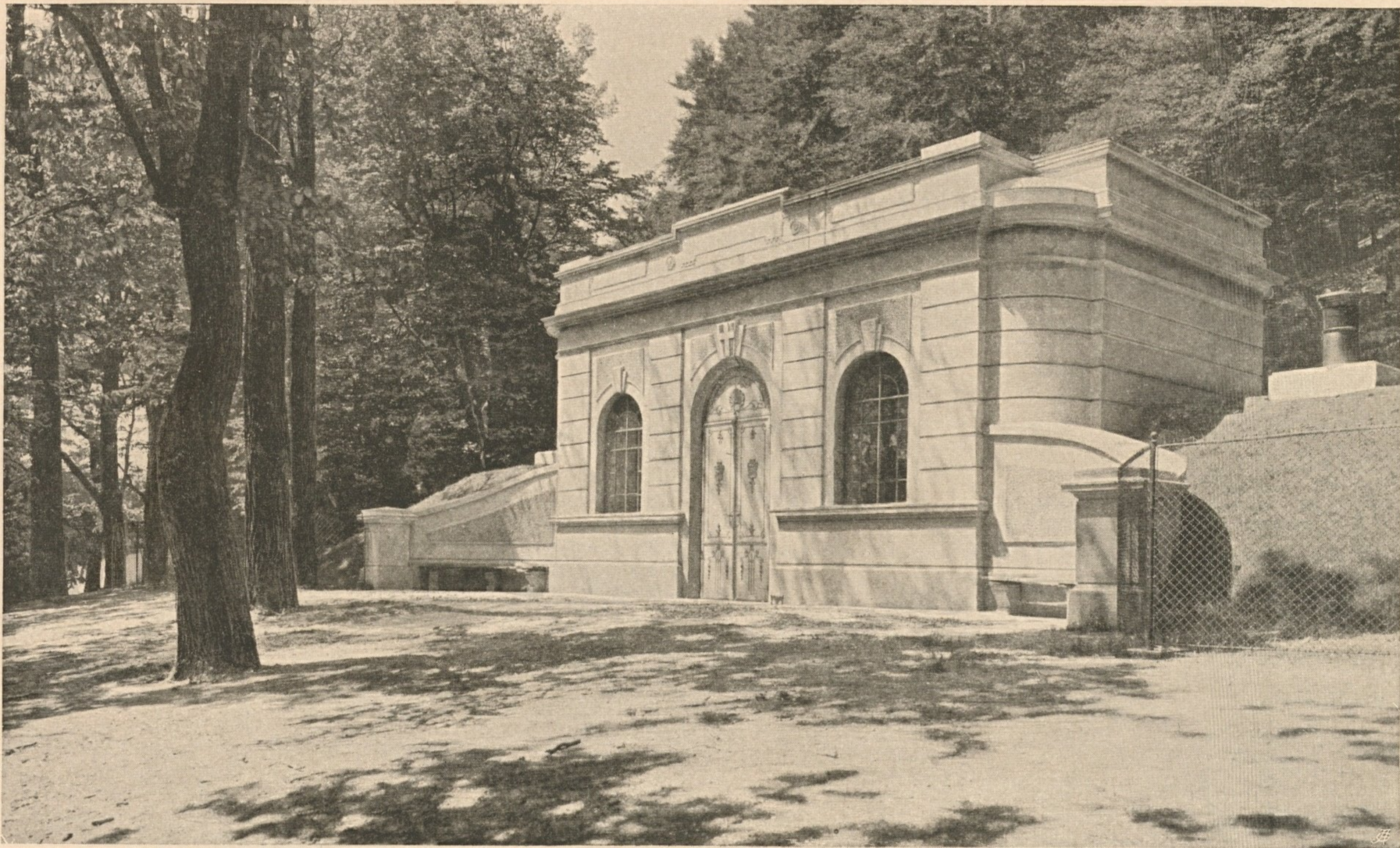
Nr. 167. Höchstreservoir Kobenzl (Fassade der Schieber- kammer).