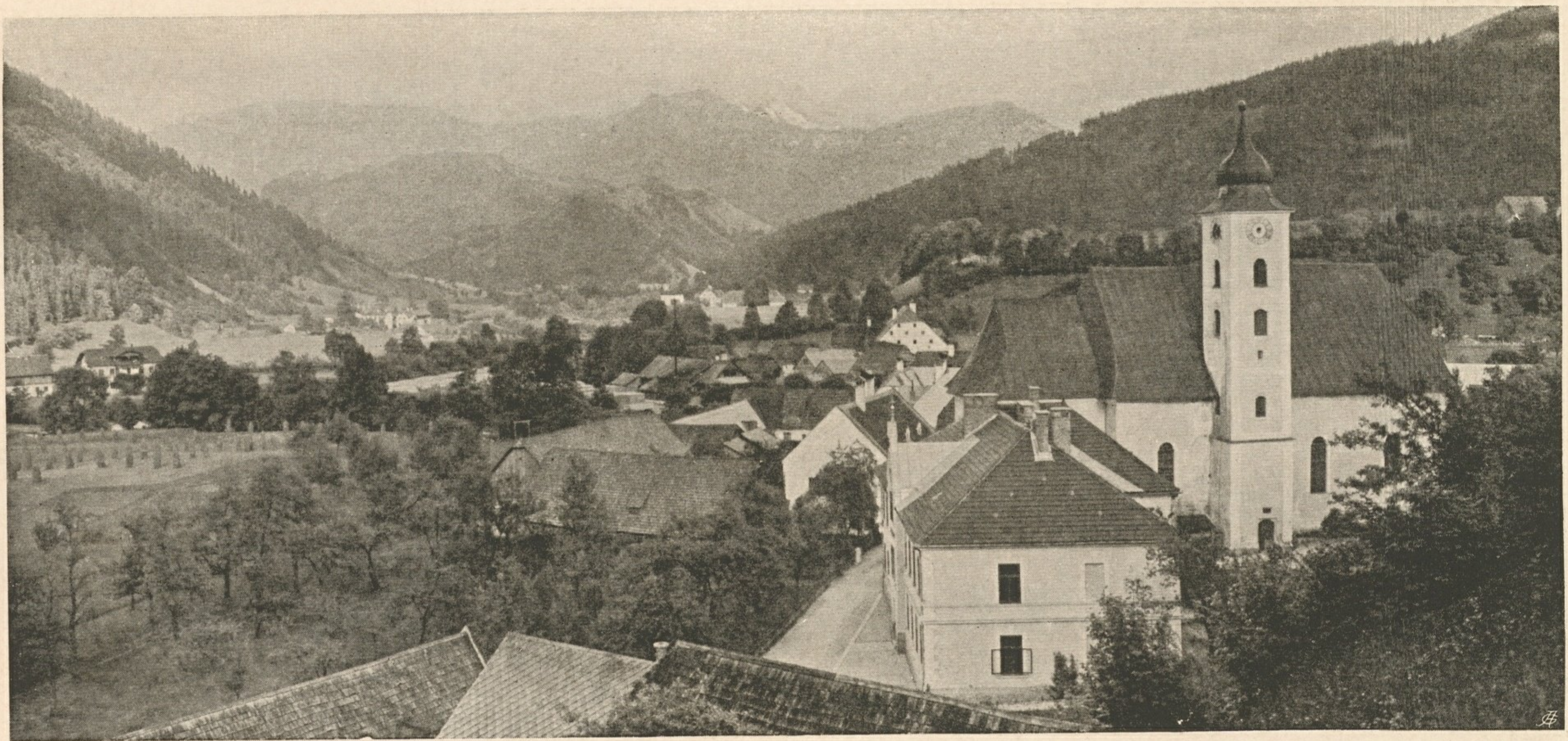
Nr. 42. Göstling a. d. Ybbs.