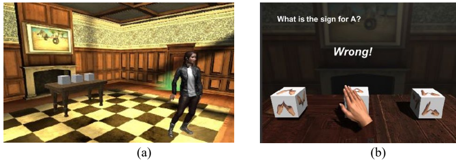
Fig. 3 Level 2 (a) The sheltered environment for practicing the signs; (b) The user recognizing the BSL signs using a leap Motion controller.

well, indicating they have learned the signs. There is no time constraint, rewards or penalties at this level. When the players feel confident they can progress to level 3.