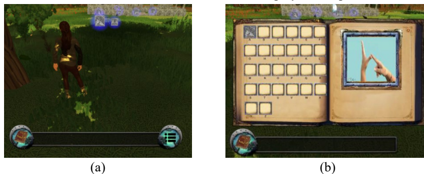
Fig. 2 (a) The forest environment in level 1 where the players collect the BSL signs; (b) inventory of the collected BSL signs and video playing the sign gesture.

At this level the game mechanics used is exploration, discovery and collection of signs to advance to the next level. There is no time constraint, rewards or penalties. Once all the letters in this level have been collected the players can proceed to level 2.