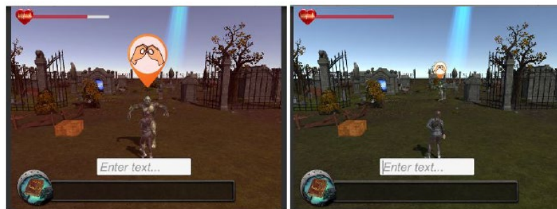
Fig. 4 The battle, the players have to correctly recognise the BSL signs shown on top of the enemy/minion by hitting the respective key on the keyboard to keep the enemy away.

The enemy in Level 3 was inspired by a collection of sea monsters. The enemy is bigger than the player's avatar and fearsome to add to the fear factor of the game [22].