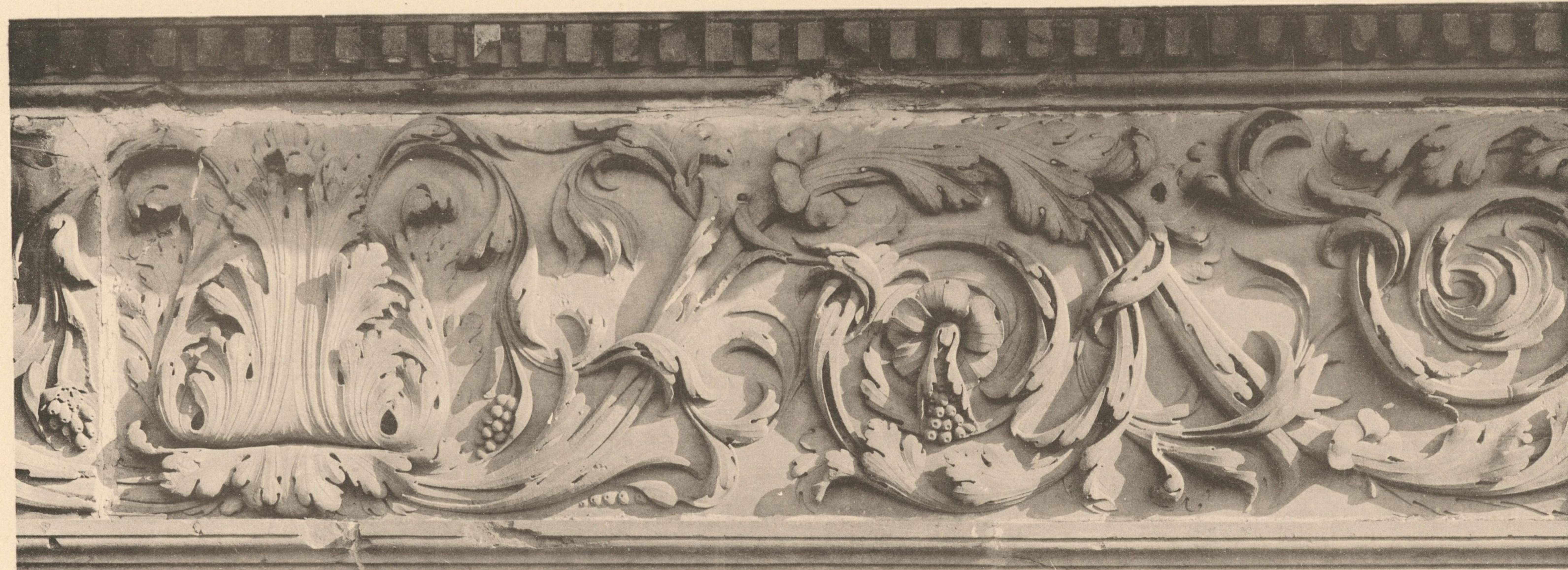
FRIES-ORNAMENTE DES PARTERREGEBÄLKES.