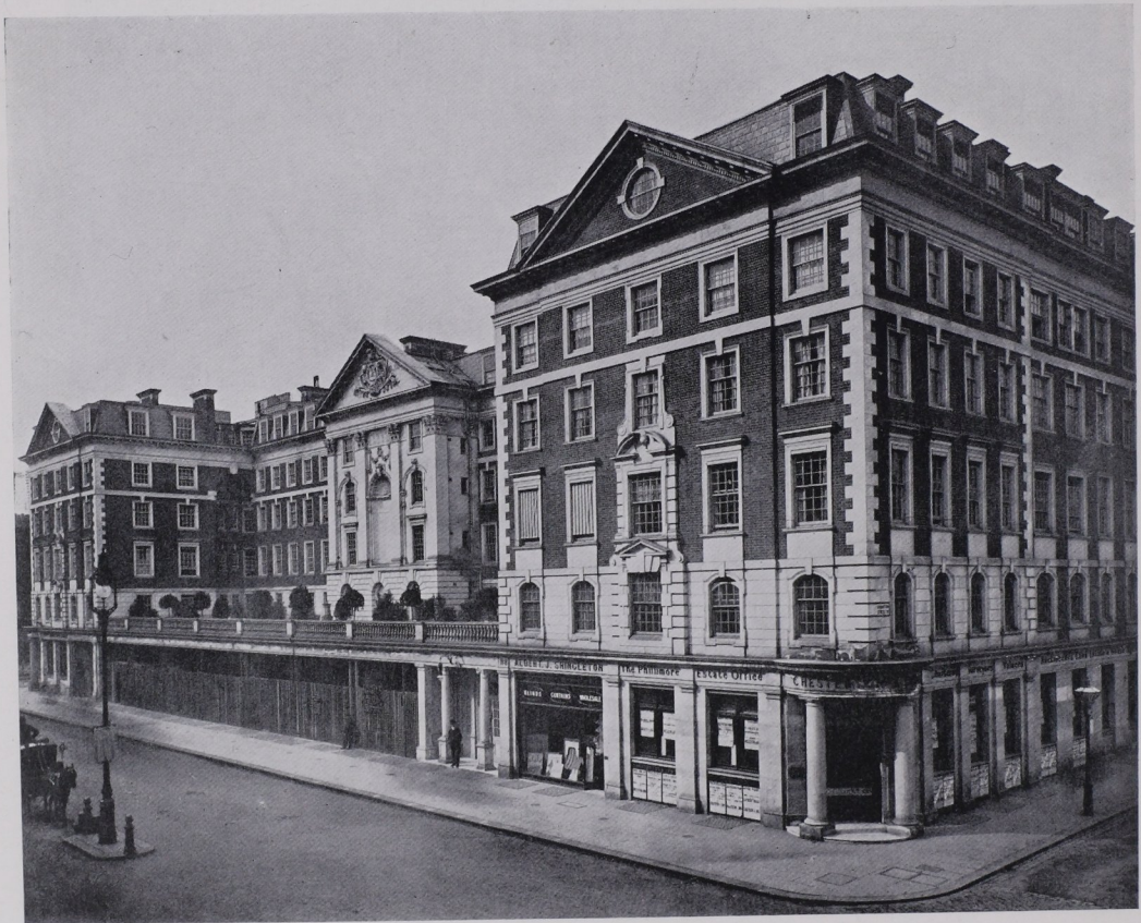
HORTON COURT, KENSINGTON, LONDON. SECOND FLOOR PLAN AND THE FRONT TO KENSINGTON HIGH STREET. THE MATERIALS ARE ENGLISH RED BRICKS, PALOTTE STONE FROM FRANCE, WITH PORTLAND STONE FOR THE GROUND FLOOR. THE SUITES OF ROOMS ARE DESIGNED FOR DIFFERENT INCOMES, SOME BEING SMALL AND OTHERS LARGER. THE RENTS, INCLUDING RATES AND TAXES, RUN FROM £90 TO £210 PER ANNUM. NOTE THE GARDEN TERRACE ABOVE THE SHOPS, THE ABSENCE OF AN AREA, AND THE DIRECT WINDOW-VENTILATION GIVEN TO EACH CORRIDOR

F. S. Chesterton and J. D. Coleridge, Architects