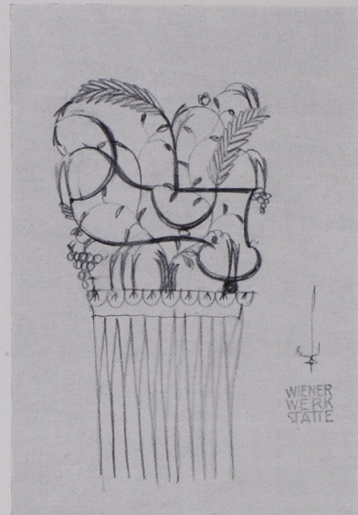
GESCHNITZTE KASSETTE UND KAMM (BLEISTIFT) CASSETTE SCULPTÉE ET PEIGNE CARVED BOX AND COMB (PENCIL-DRAWING)