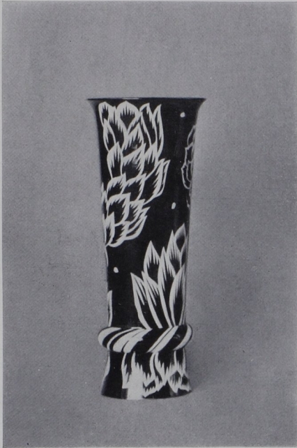
FRÜHKERAMIK PREMIÈRE CÉRAMIQUE EARLY CERAMIC