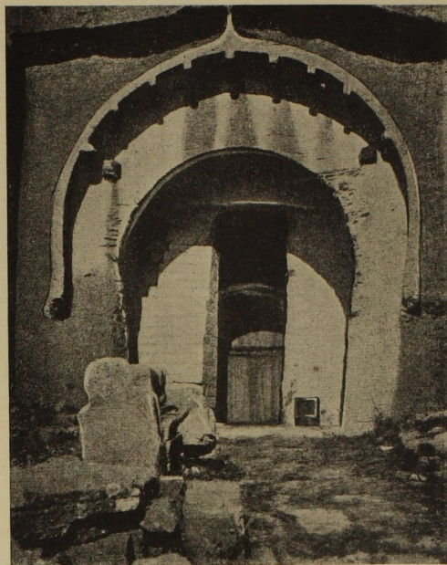
33. Felsentschaitya in Guntupalle