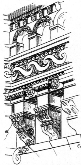
Schloß La Courtinière. Gefims 412 ).