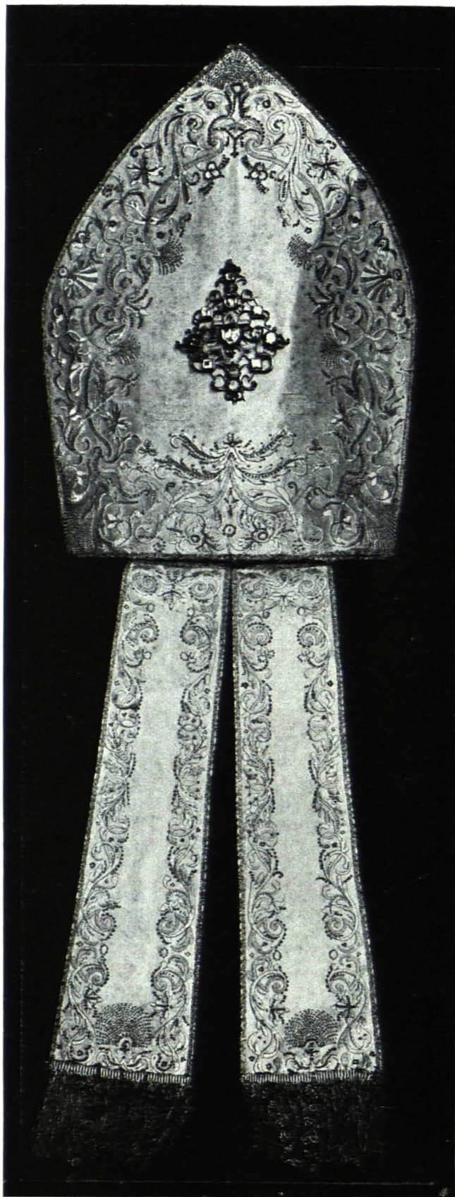
Fig. 125 Mitra Nr. 6 (S. 85)