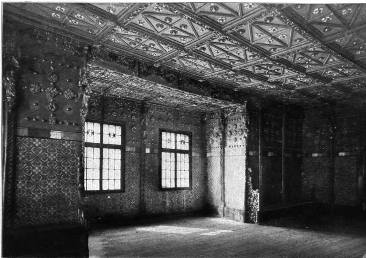
Fig. 187 Hohensalzburg, altes Schloß, Goldene Stube (S. 120)