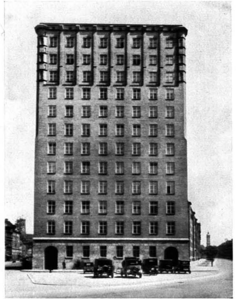
184. Münchener Hochbauamt (Leitenstorfer): Technisches Rathaus. 1926