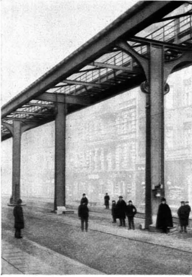
149. Bruno Möhring: Stadtbahn Berlin. 1909