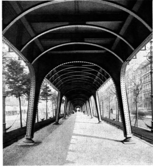
150. Alfred Grenander: Stadtbahn Berlin. 1909