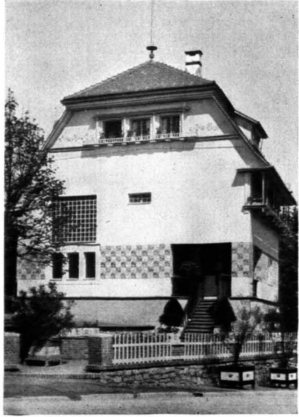
103. Joseph M. Olbrich: Haus Olbrich, Darmstadt. 1901