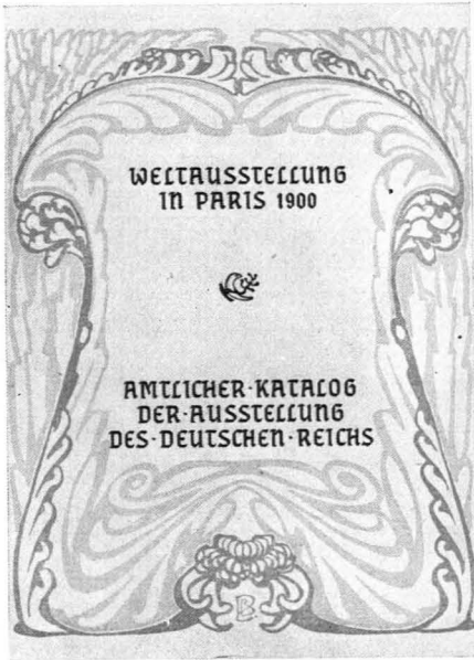
92. Bernhard Pankok: Titelblatt. 1900