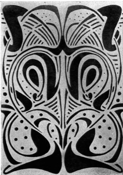
94. Henri Van de Velde: Buchschmuck