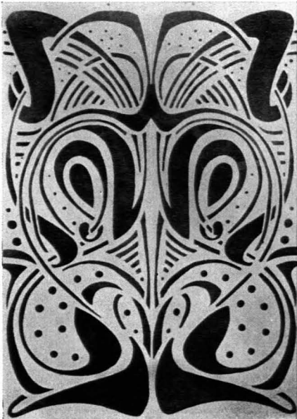
94. Henri Van de Velde: Buchschmuck