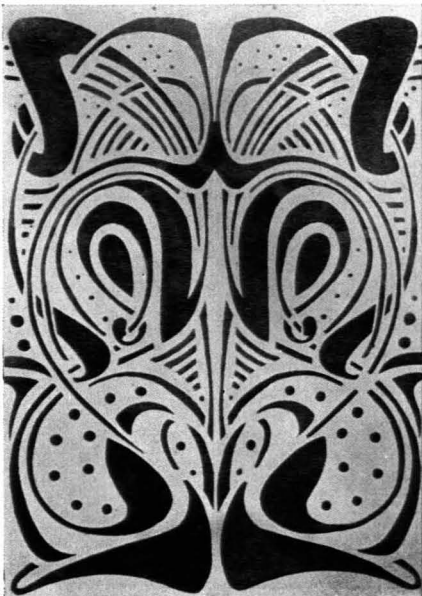
94. Henri Van de Velde: Buchschmuck