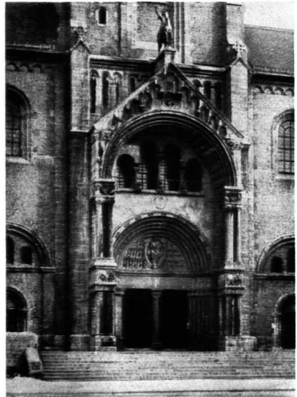
85 und 86. Gabriel v. Seidl: St. Anna-Kirche in München. 1888/99