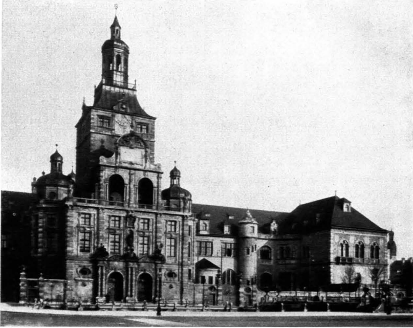
84. Gabriel v. Seidl: National-Museum in München. 1894/99