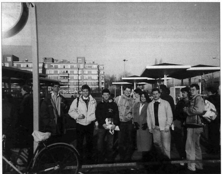
„Estiemers“ at Enschede