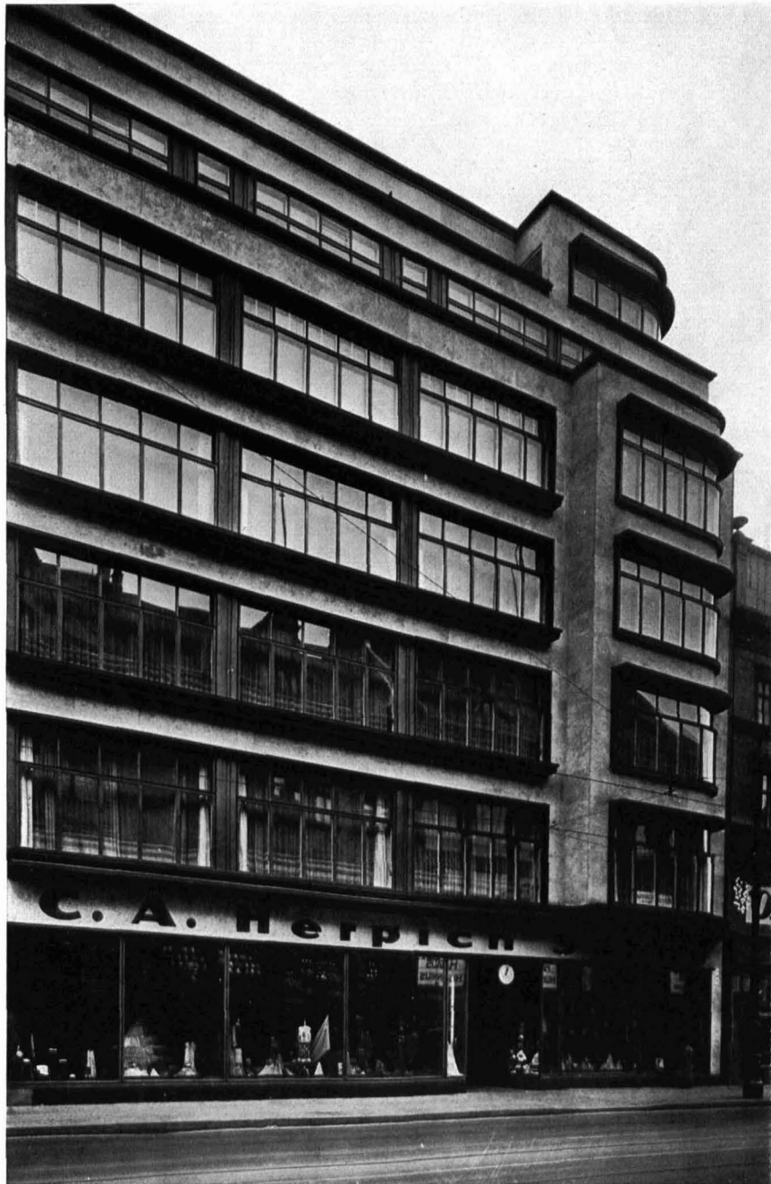
429 / BERLIN Umbau des Herpich-Hauses Department Store Arch.: Erich Mendelsohn, Berlin