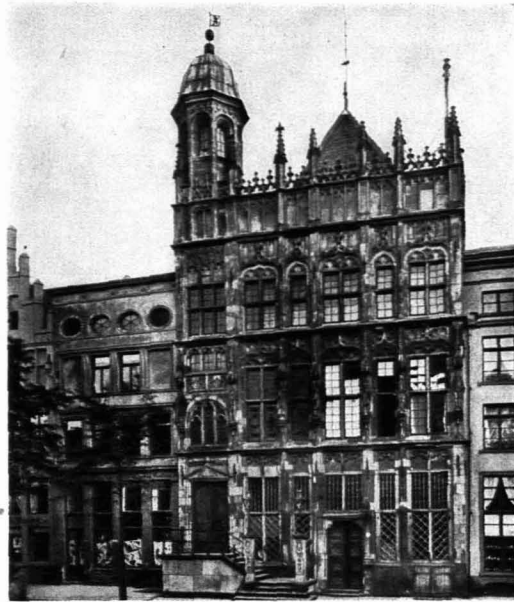
298 / WESEL Rathaus. Fassade Ende 15. Jahrh. Town-hall. Façade, built end of the 15 th century