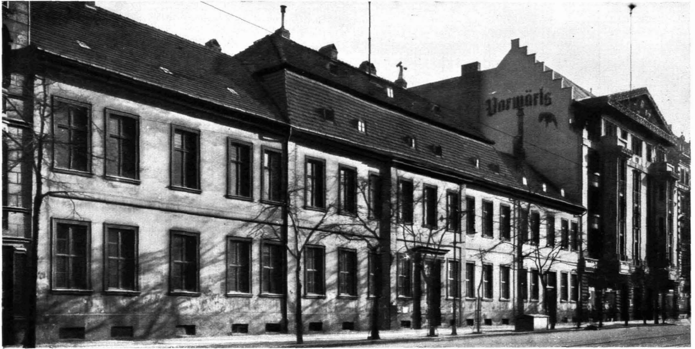
285 / BERLIN Lindenstraße 4 / 18. Jahrh. 18th century