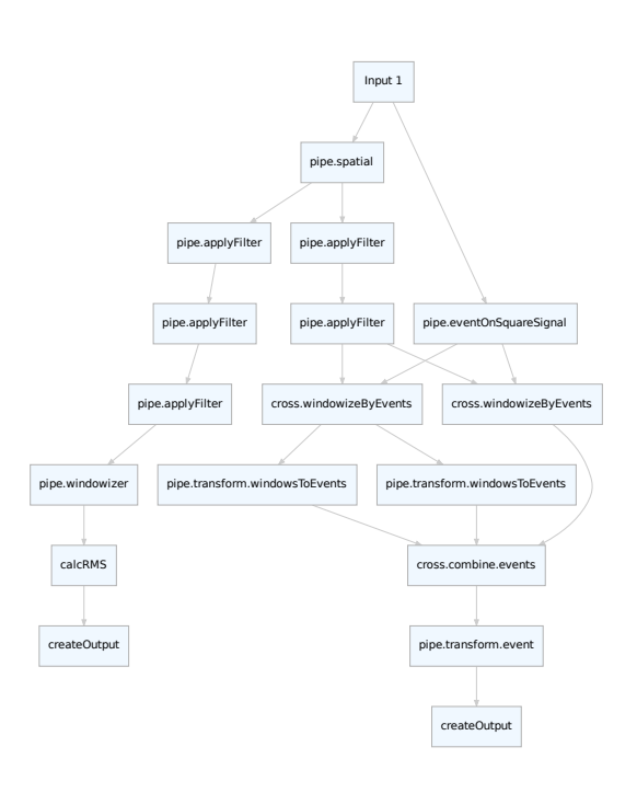
Figure 3: Data processing plan for EMG processing. Arguments for the processing steps are not visualized on this chart.

Using Resonance library allows not only to execute online and offline processing, but also helps to visualize it. For example, figure 3 is the automatically generated visualization of data processing plan for EMG processing from the example experiment.