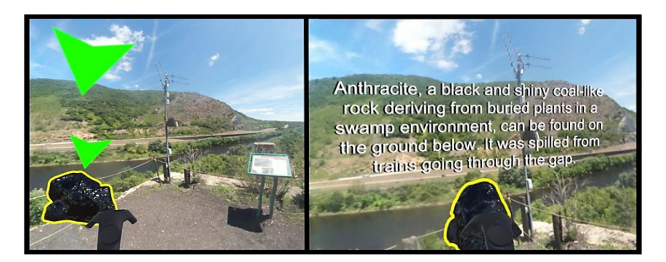
Fig. 1. Using the controller 'Grip', it is possible to freely manipulate 3D objects. Once grabbed, its description appears.