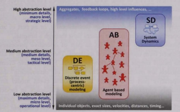
Fig. 3. Commonly used paradigms in Simulation Modeling (Borshchev & Filippov 2004).

applications of all approaches (e.g.: Brailsford 2014; Siebers et al. 2010; Brailsford et al. 2010).